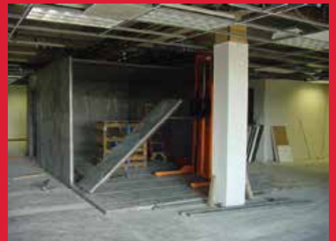
Vault designed to fit customized dimensions