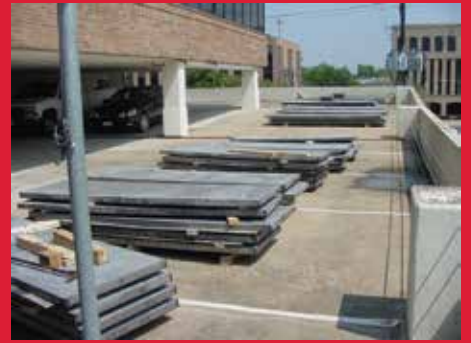
Ultra-strength concrete and formed steel panels

In-plant inspections ensure panels are constructed using the proper procedures and materials.