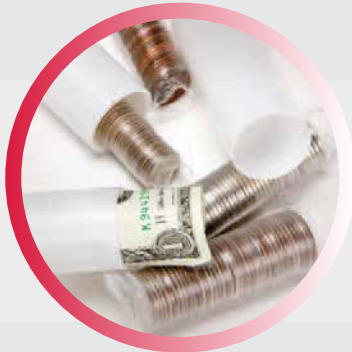
User-determined change denominations