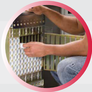
Visible change tube loading

Simple to load, easy to audit, and virtually maintenance free!