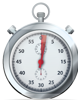
Average Smash & Grab Time - Less than 2 minutes