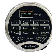
SecuRam Prologic Lock